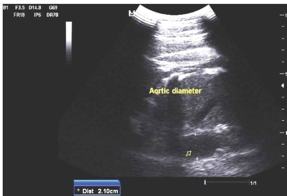
Fig. 2. Measurement of fetal lateral aortic diameter by B-mode ultrasonography (obtained with a 3.5 MHz macroconvex transducer at 275 days of gestation in a Holstein-Friesian cow). Note that the measurement is made between the inner edges of the aortic wall with the callipers of the ultrasound

cant correlation between fetal aortic diameter and birth weight ( R = -0.023 , P = 0.893 ). A significant negative correlation has been detected between fetal aortic diameter and fetal heart rate ( R = -0.41 , P = 0.012 ). Statistical calculations (correlation) were done as described by StatSoft Inc. (2011). Repeated measurements of the fetal aortic diameter showed a good reproducibility with a CV% of 9.2. The results of the water bath measurement were as follow: Calf 1 was 26 kg with 2.00 cm aortic diameter; Calf 2 was 23 kg and had 1.90 cm aortic diameter; Calf 3 was 40 kg and had 1.78 cm aortic diameter. Although two of the dead calves were smaller than the average of the in vivo group, the results of the post-mortem group highlighted the absence of an association between fetal aortic diameter and birth weight.